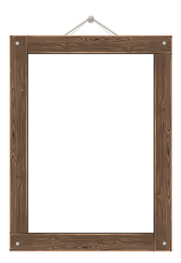
Draw who you have come to find in the frame above.