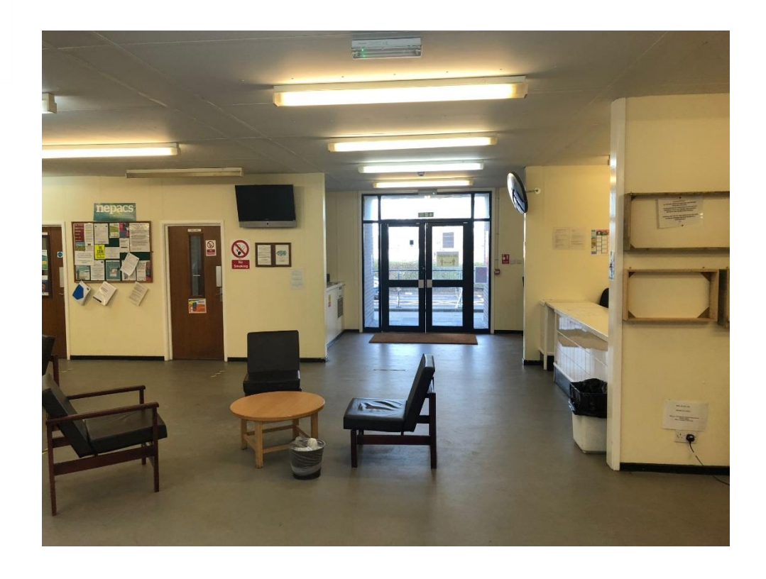
VISITS CENTRE TEA BAR