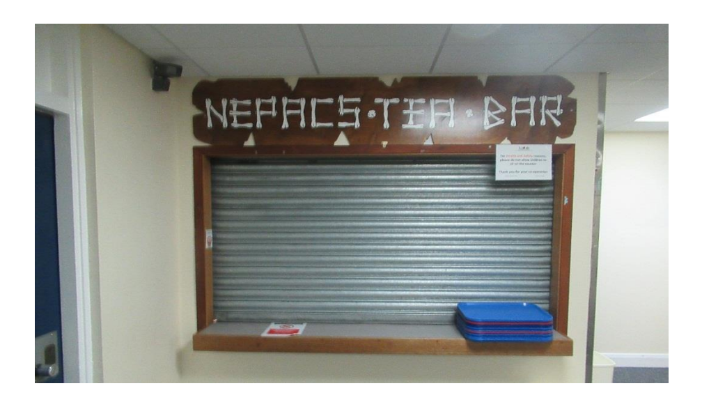
Children's play areas