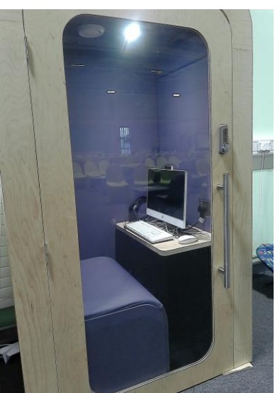
Purple Visits (video calling booths)