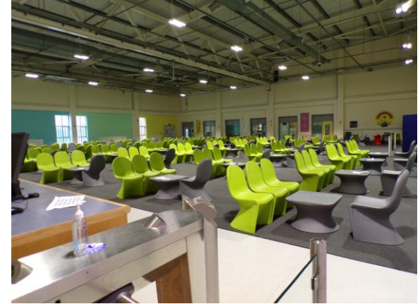
Entrance to Visitor Centre