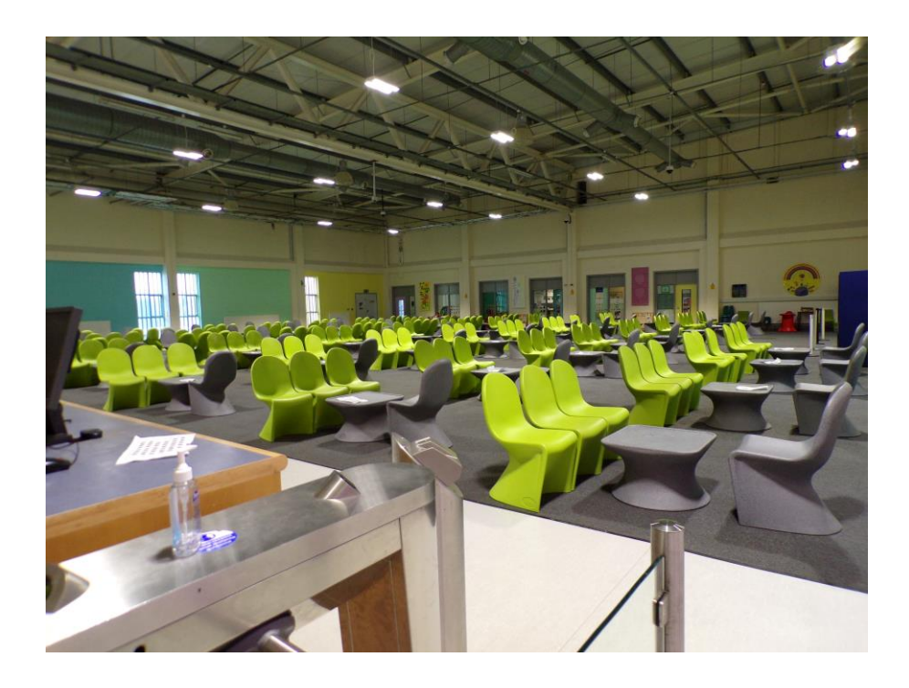
Forest Bank Visits Hall

The number of social visits a prisoner receives is determined by several factors. This includes their prison status i.e. whether they are sentenced or on remand. The entitlement for remand prisoners is higher than that for those that are sentenced. The prisoners' IEP level (Incentives and Earned Privileges) also affects the social visits entitlement. Prisoners are categorised as either Basic, Standard or Enhanced. The allocation for Enhanced prisoners is more favourable.